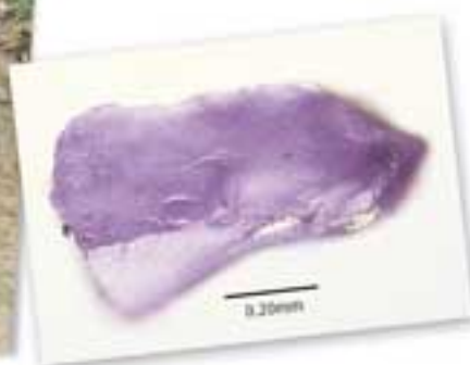
G9 Chrome Pyrope Garnet