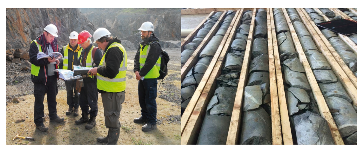
Field Team in Longford-Down Massif.